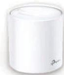
TP-LINK DECO X20*