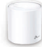
TP-LINK DECO X20*